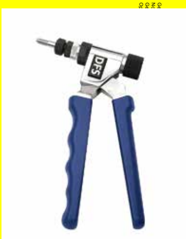
DFS 307 T

Compact & practical hand tool for light duty assembly.