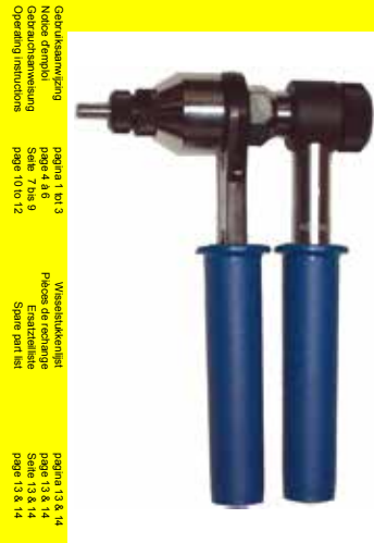
DFS 311 T