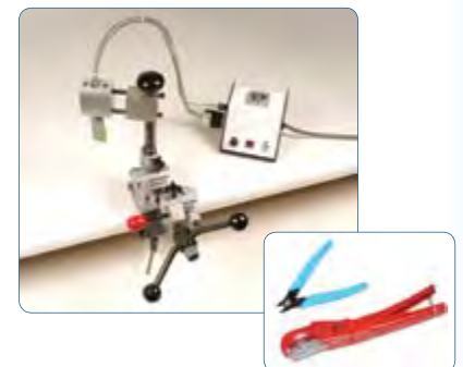
Flash Cutters & Cutting Shears